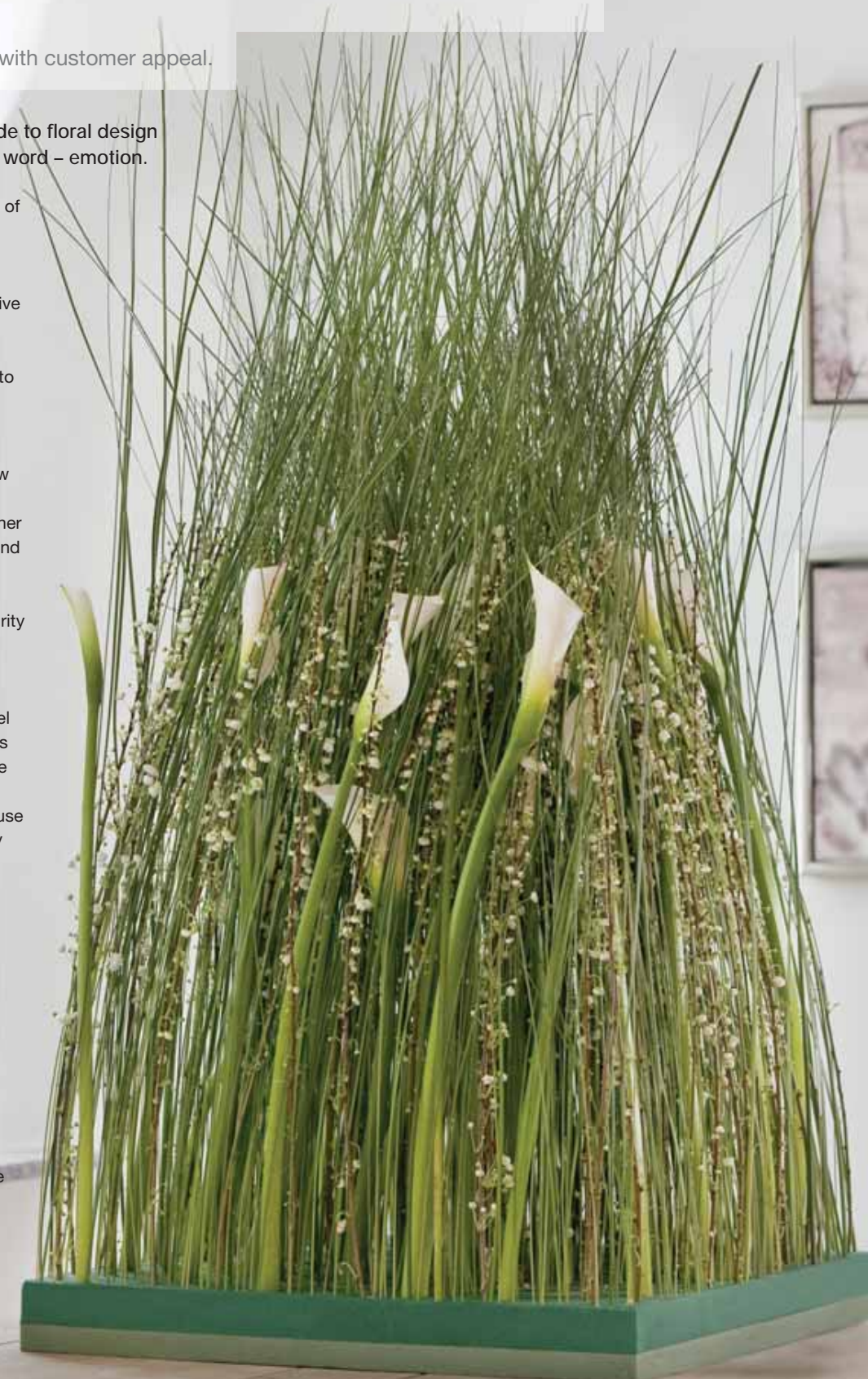
Design by Anette Østergaard

OASIS® FOAM FRAMES® Designer Sheet 61 x 61cm (24 x 24")