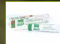
OASIS® Floral Adhesive Tube