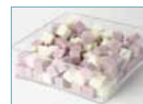
Square Acrylic Bowl