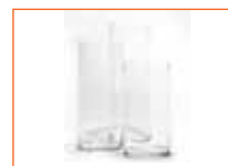
Large Tall Glass Cylinder