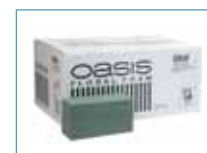
OASIS® Ideal Floral Foam

SUNDRIES OASIS® Ideal Floral Foam Lime Green Midelino Sticks Turquoise Midelino Sticks Square Acrylic Bowl OASIS® Floralife® Flower Food