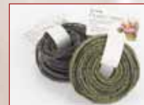
Rustic Grapevine Wire