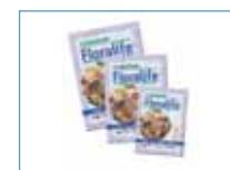
OASIS® Floralife® Flower Food Sachets