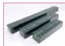
OASIS® Raquette 60cm

Strong diagonal lines set the tone for Helen's fresh thinking design. A study in contrasts, the delicate overlay of flowers softens the dynamic curtain of slanting black Willow Bundles. The OASIS® Raquette is cleverly rolled in sunflower seeds and sprayed with Flat Black OASIS® Spray Colour to give a rough textural interest to the base.