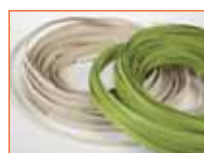
Flat Midelino Coils