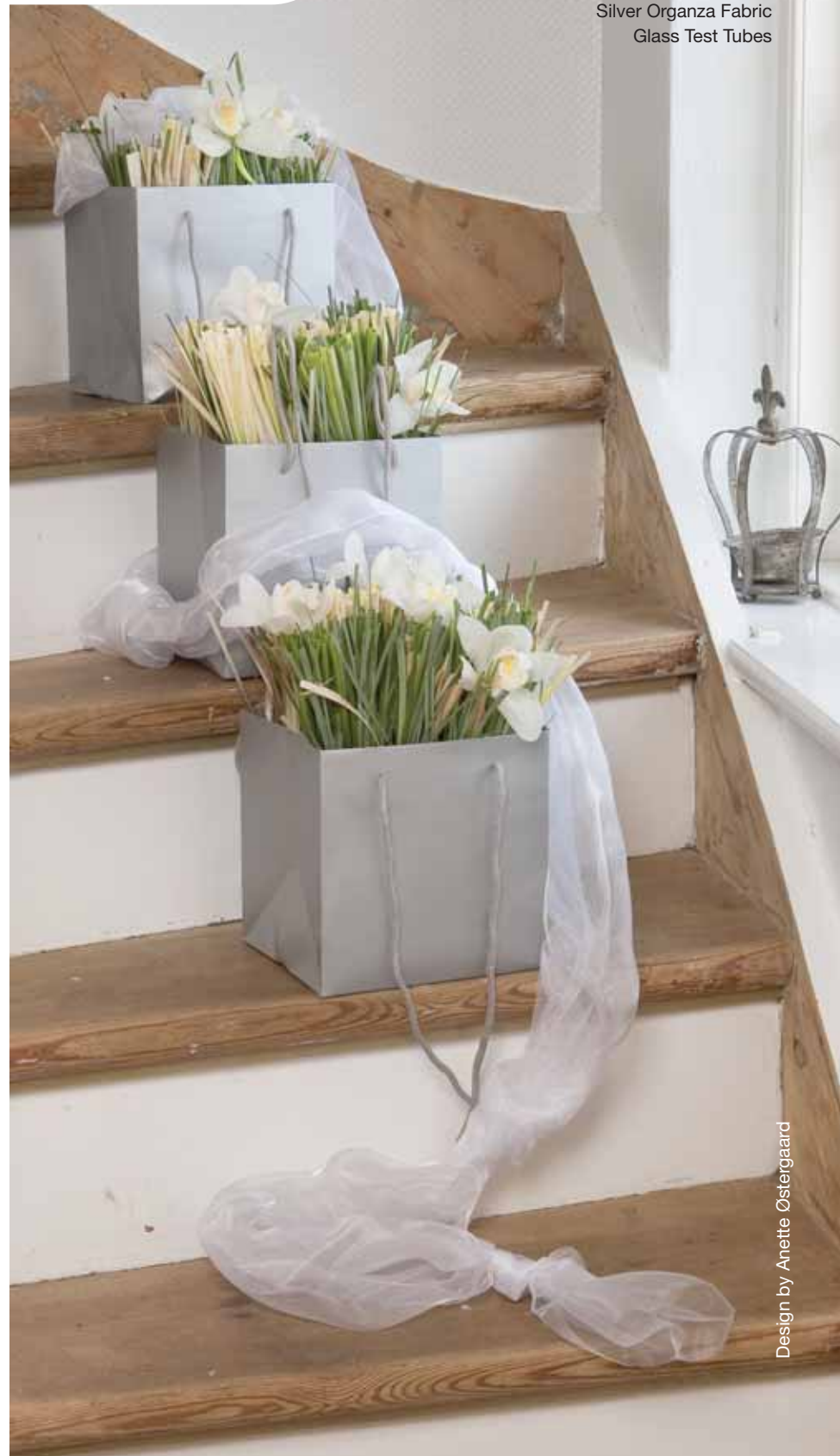
Design by Anette Østergaard

SUNDRIES OASIS® Ideal Floral Foam Silver Porto Bag with Rope Handle Clear 15cm Acrylic Designer Cube Silver Organza Fabric Glass Test Tubes