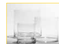
Tank Glass Cylinders

The OASIS® Floral Products Tank Glass Cylinder Vase is ideal for the transparent look Anette wished to achieve. Balls of ivory OASIS® RAINBOW® Foam make a compact and clever base for the long flowing lines of Steel Grass. Phalaenopsis Orchids give the arrangement a luxurious quality.