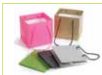
Porto Bag with Rope Handle