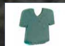
OASIS® FOAM FRAMES® Football Shirt

Helen's classic shirt design complete with a raised Sisal number nine is edged with royal blue Poly Ribbon and covered with a textured base of Eryngium, then finished with cuffs of Gypsophila and a white Chrysanthemum collar.