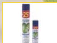
OASIS® Floralife® Leafshine