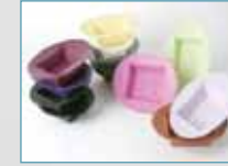
Oval Designer Bowls