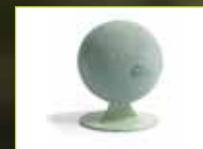
OASIS® Bioline® 3D Football