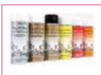
OASIS® Spray Colour