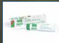
OASIS® Floral Adhesive Tube