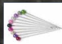
6mm Round Headed Pearl Pins