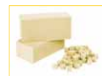
OASIS® RAINBOW® Foam Ivory