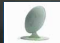
OASIS® Bioline® 3D Rugby Ball

foam underneath. Cut the stem ends of the Chrysanthemum diagonally for easy insertion into the floral foam.