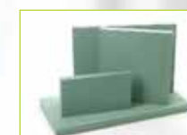
OASIS® FOAM FRAMES® Designer Sheet

A natural wind blown look is created with a meadow of Steel Grass interspersed with Prunus and Zantedeschia. Bringing the natural look of grasslands into the home and reinventing the use of floral foam is a revolutionary idea that is brave and contemporary, just like Anette.