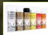
OASIS® Spray Colour