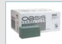
OASIS® Ideal Floral Foam

Made in an Oval Designer Bowl that holds plenty of OASIS® Ideal Floral Foam, the container has sufficient room to top up with water without spillage. The stylish swirl of Midelino Sticks gives an added fluid dimension to a baby boy arrangement.