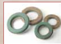
OASIS® Biolit Rings

Oozing rustic charm, the Rustic Grapevine Wire can waft an individual design element into any arrangement. Striking Anthurium clavi leaves make a sensational covering for the OASIS® Biolit Ring. A tangled webbing of brown Rustic Grapevine Wire shields the Cymbidium Orchids that are tucked between the exotic leaves. Just get on the grapevine for distinctive designs.