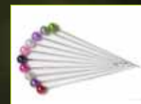
6mm Round Headed Pearl Pins