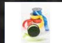
Poly Ribbon Satin