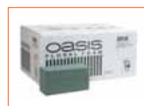
OASIS® Ideal Floral Foam

SUNDRIES OASIS® Ideal Floral Foam Large Tall Glass Cylinder Vase Black Mitsumata Black Willow Bundle Black Flat Midelino Coil Glass Test Tubes Black Crushed Ice