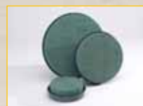
OASIS® NAYLORBASE® Posy Pad

Step 3 Continue to add more Tulips building up the design to develop several layers of interest, and keep entwining the Tulips to create a domed shape. Don't forget to re-cut the stems with a knife to produce a sharp diagonal cut and push the stem firmly into the floral foam to aid security and longevity.