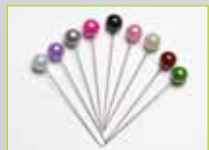
10mm Round Headed Pearl Pins

In-house gift sales can plummet when the summer holidays arrive and everyone has taken flight.