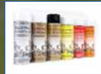
OASIS® Spray Colour