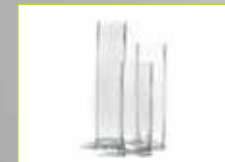
Large Tall Glass Cube Vase