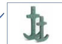
OASIS® FOAM FRAMES® Anchor