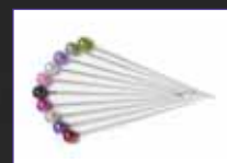
6mm Round Headed Pearl Pins