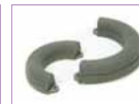
OASIS® Bioline Half Rings