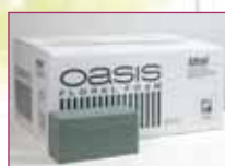
OASIS® Ideal Floral Foam

Together with the low, densely packed flower design this means great lasting qualities for the recipient. Pine Cones make a perfect seasonal edging for the rich, dusky tones of burgundy and purple, and then Rubus, Rosehips and Crab Apples give the hedgerow look of autumn. Your customers have a treat in store when they receive one of these baskets full of autumn flavour.