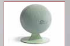
OASIS® Bioline 3D Football