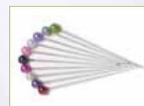
6mm Round Headed Pearl Pins