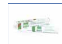
OASIS® Floral Adhesive Tube