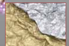
Double Sided Metallic Tissue Paper