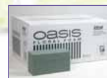
OASIS® Ideal Floral Foam