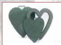
OASIS® NAYLORBASE® Open Heart

With a 5cm depth of OASIS® Ideal Floral Foam the flowers will be secure and long lasting and the anti slip feet will prevent movement when the heart is placed. Offering customers a choice of colour ways or incorporating the deceased's favourite flower will help to personalize this dearly loved tribute.