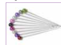
6mm Round Headed Pearl Pins