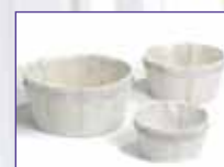
Natural Wood Round Bowl