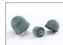
OASIS® NAYLORBASE® LE BUMP®