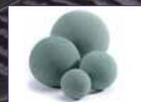
OASIS® Ideal Floral Foam Spheres