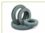
OASIS® NAYLORBASE® Rings

To keep the seasonal evergreens and mosses fresh they are inserted into a 12" OASIS® NAYLORBASE® Ring with added dried Peppercorns, Chillies, Crab Apples and baubles in Christmassy colours. A double edging of Mikado Reeds extends the size of the door decoration and the long Mikado Reed extensions add an extra design edge to the interesting mixture of traditional materials.