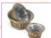
Dark Stained Willow Bowls