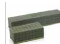
OASIS® Bioline Double Raquette

The top oblong shaped spray made on an OASIS® Bioline Double Raquette is encased with Organza Fabric and continues the mixed pink and cream colour scheme with Ivy trails woven through, elongating the design.