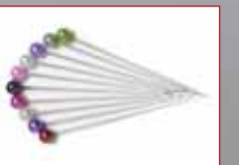
6mm Round Headed Pearl Pins