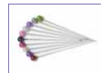
6mm Round Headed Pearl Pins