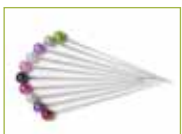
6mm Round Headed Pearl Pins