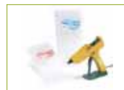
High Melt Glue Gun and Glue Sticks