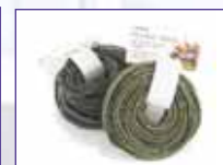
Rustic Grapevine Wire