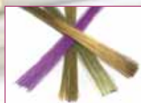
Metallic Paper Covered Wire Lengths

FLOWERS AND FOLIAGE Rubus fruticosus 'Chester' Rubus Tricolour trails Rosehips 'Amazing Fantasy' Carnations 'Farida' Spray Rose 'Pepita' Dahlia 'Viking' Cotinus Hedera trails Pinus contorta