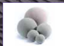
OASIS® SEC Dry Foam Spheres