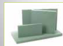
OASIS® FOAM FRAMES® Designer Sheets

An OASIS® FOAM FRAMES® Designer Sheet is cut to size and secured to a wooden structure for stability. Massed Hydrangea is the base for a cascading arrangement of Callas, Roses, Dianthus and Poppy Heads with maximum impact. Tall Church Candles give added impact to a clever design idea.