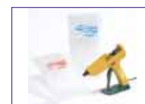
High Melt Glue Gun and Glue Sticks