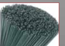
Green Lacquered Stub Wire