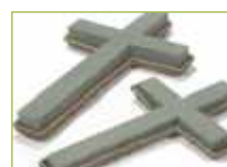
OASIS® Biolit Cross

Looped Cordylone leaves with their lime green edging boldly accentuate the embolic shape. Groups of Roses, Viburnum, Callas and Ornithogalum Arabicum are overlaid with a fine Clematis vine to link the base and flowers together. This is a unique design to offer customers breathing new life into a favourite religious tribute.