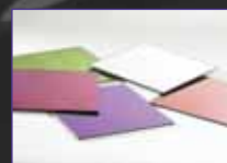
25cm Square Mirrored Plates

FLOWERS AND FOLIAGE Phalaenopsis Orchid Hedera leaf Conifer