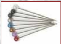
5mm Round Headed Pearl Pins