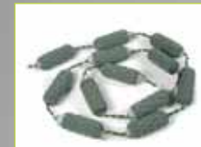
OASIS® Ideal Floral Foam Netted Garland

A cane construction housed in a Large Tall Glass Cube keeps the Garland stable, and it's the perfect solution when tall slender designs are required. The OASIS® Ideal Floral Foam Netted Garland has a net covering to give extra security to the flowers and foliage, plus it can be easily cut to the required length. To make this lofty design follow Daniel's easy instructions.