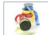
Poly Ribbon Satin