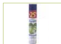
OASIS® Floralife® Leafshine