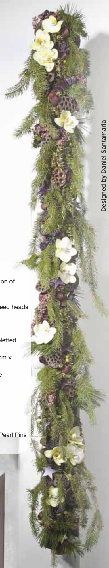
Designed by Daniel Santamaria

OASIS® Ideal Floral Foam Netted Garland Large Tall Glass Cube - 60cm x 13cm Green Lacquered Stub Wire Clear Crushed Ice Natural Finland Moss Mossing Pins Gold Metallic Wire Lotus Heads Anchor Tape Lilac 6mm Round Headed Pearl Pins 6 Long Garden Canes